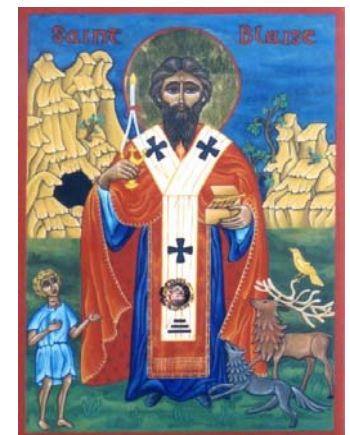
Blessing of Throats

Blaise, Bishop and Martyr Tuesday, February 3